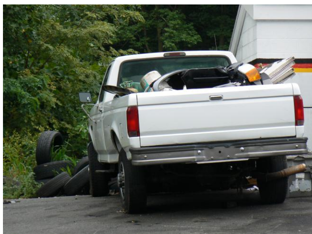
Pile of old tires and (unlicensed) truck with dismantled parts