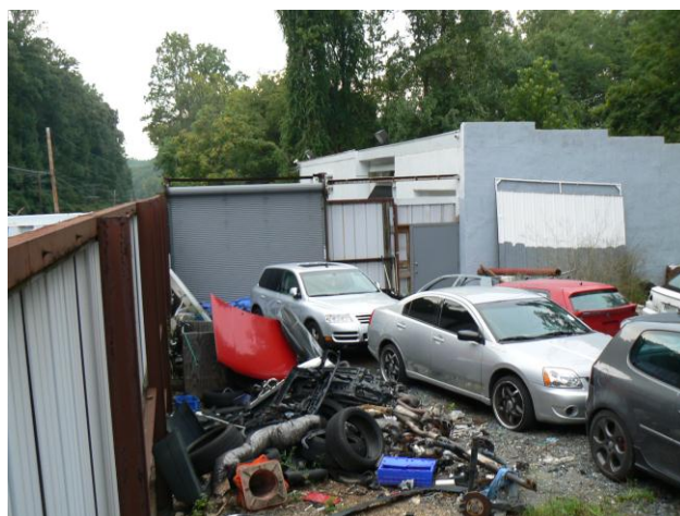
Inside the fence