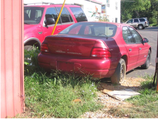
#7097 8 Aug 2006 - Unlicensed vehicle with flat tire (photo taken while standing on the sidewalk along Belair Rd)

Re: 11854 Belair Rd (JSI Auto) August 9, 2006