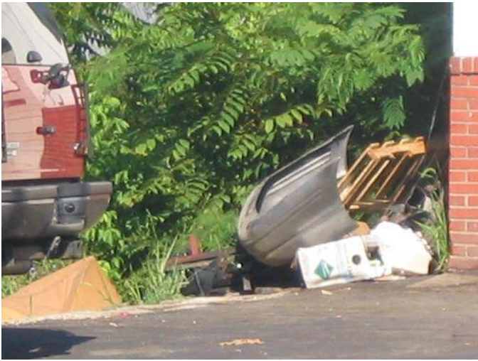
Close up of #7096